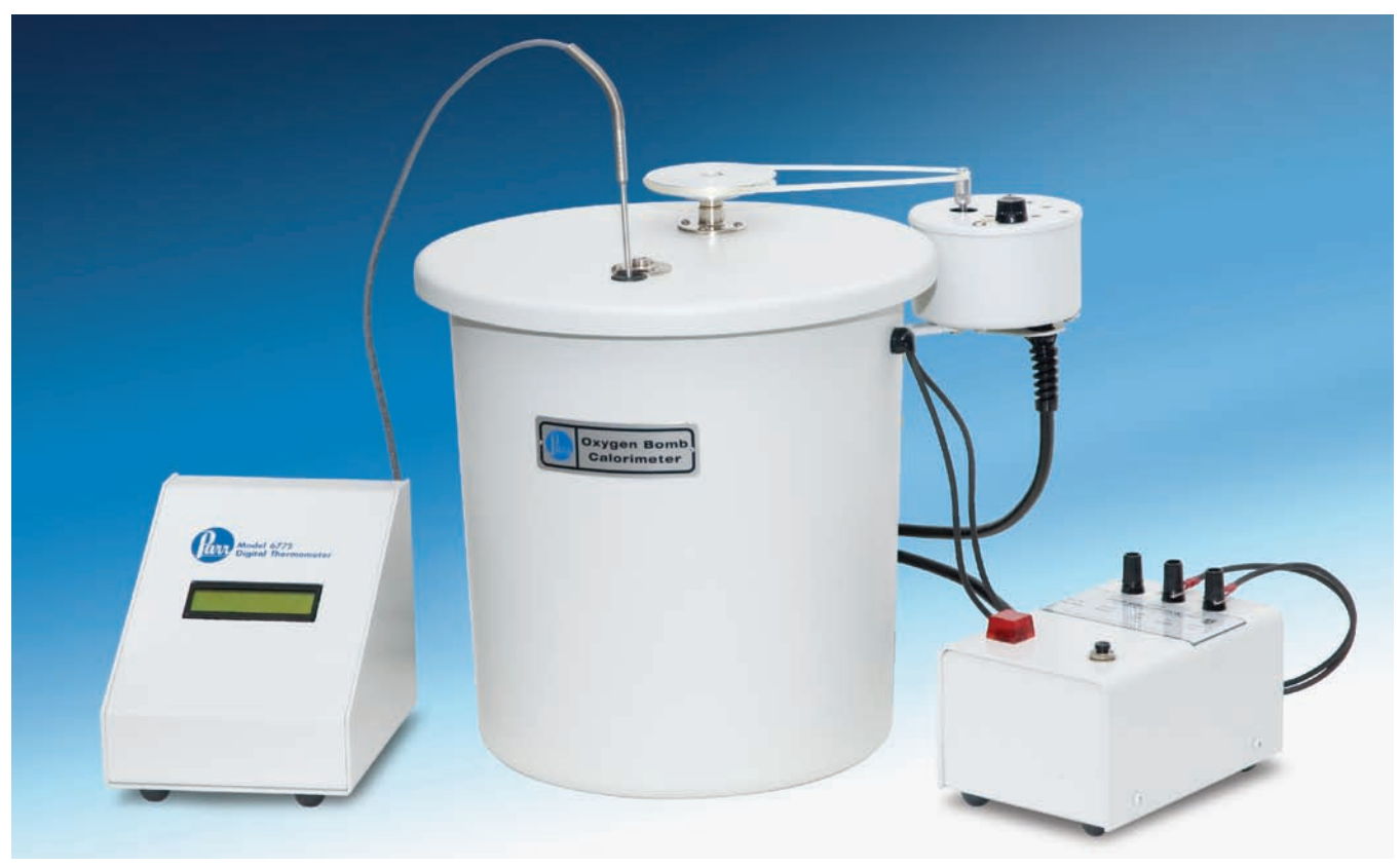
1341 Calorimeter with 6775 Digital Thermometer & 2901 Ignition Unit